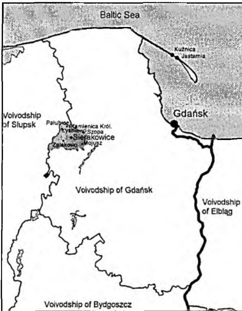
Fig. 1. Map of Kashubia

The fingerprint patterns were identified using Lestrangé's classification system supplemented and elaborated by BOCHENSKA [1964] and ROGUCKA [1968].