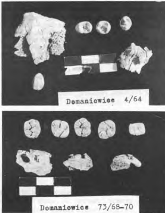
Fig. 1. Human skeletal remains from cremated grave. Crowns of non-erupted permanent teeth in the upper row of the picture

functions developed using two tooth crown diameters - mesiodistal and buccolingual. These functions provide an additional method for sexing children remains from cremated graves.