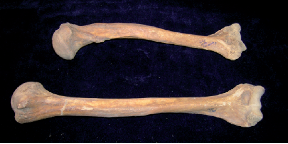
Fig. 3. Fractured left humerus.