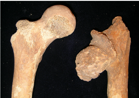
Fig. 4. Fractured left femur caput.

(Figs. 3 and 4), as well as a rib on the right side. The individual displaying most traumas was a male aged 35-43 with no less than four fractures: the right ulna (midshaft), right hu-