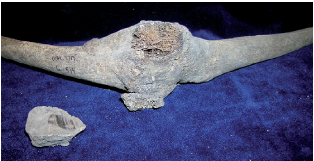
Fig. 2. Right femur/tibia fracture, left patella (same individual) with heavy ebonation.

One woman, aged between 28 and 38, had a fractured left ulna (midshaft), and the patella, distal end of her right femur and proximal end of the tibia had been crushed and found to be completely fused. The patella of her left leg had heavy ebonation, indicating that walking might have been difficult and quite painful for this woman (Fig. 2). One man aged between 29 and 34 had a fractured right radius and phalanx in his right hand. Another man between ages 26 and 36 had fractured his left humerus and femur caput