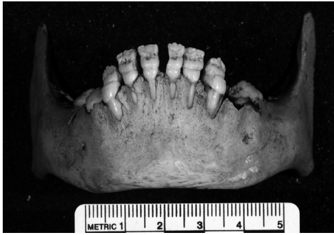
Fig. 4. All anterior teeth demonstrate pitting and linear hypoplasia. Both pitting and linear enamel hypoplasia cross all anterior teeth at the same levels