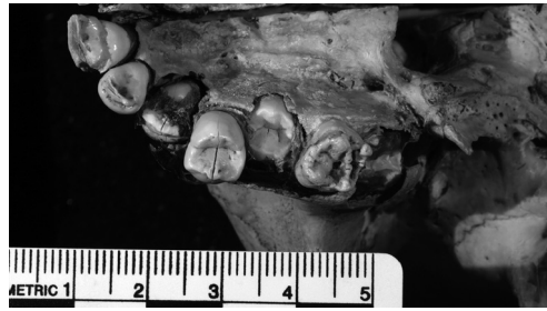
Fig. 3. Occlusal surface of the upper right permanent molar is reduced in size and hypoplastic

molars. Mandibular teeth include all incisors, both canines, right first premolar, right and left second premolars (still in crypt) and first permanent molars. The second permanent molars are still in the crypt. The crowns of the upper central incisors, up to the second third of the crown, are severely hypoplastic (pitting and linear hypoplasia) (Fig. 2). The same type of hypoplasia can be seen on the incisal third of the right lateral incisor from the middle third to the tip of the crowns of the canines. The occlusal surface of the right upper permanent molar is reduced, and hypoplastic (Fig. 3). Pitting is also observed on the occlusal surface. Severe linear and pitting hypoplasia is also observed on the mandibular anterior teeth (Fig. 4). The mandibular first permanent molars resemble the maxillary right first permanent molar (Fig. 5).