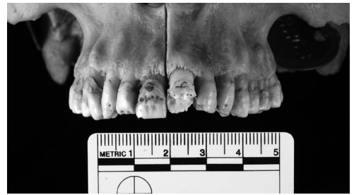
Fig. 6. The upper central incisors demonstrate linear and pitting hypoplasia on the incisal and middle third of the crowns. The same hypoplasia is evident on the incisal third of the lateral incisors and canines

evident on the incisal and middle third of the maxillary central right incisor and the incisal third of the lateral incisors and canines (Fig. 6). Black spots are visible on the middle third of the crown of the right central incisor. The crown of the left maxillary central incisor has broken away from the middle third of the crown to the incisal third. Black spots are just visible on the left central incisor at the same level as the right incisor. On the mandibular anterior teeth, linear and pitting enamel hypoplasia is evident on all anterior teeth at the same level (Fig. 7). The enamel of the left canine has broken off.