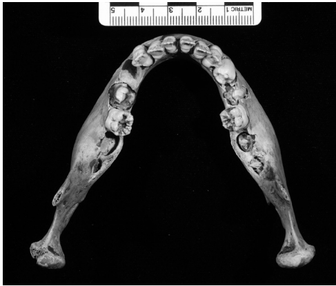
Fig. 5. The mandibular molars resemble those in the maxilla

Crowns of the upper central incisors, right lateral incisor, and tips of canines are severely hypoplastic, possibly caused by mercury. The maxilla bone in the region above the incisors shows resorptive remodeling.