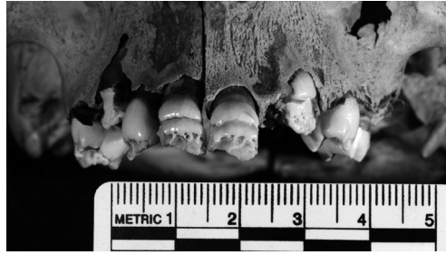
Fig. 2. Crowns of the upper central incisors, right lateral incisor, and tips of canines are severely hypoplastic, likely caused by mercury

2118 is a 13-year-old African American female. Cause of death was pericarditis. Skull morphology was normal. Permanent teeth include the maxillary central incisors, right lateral incisor, both canines (not fully erupted), first and second premolars (right second premolar not fully erupted), and first permanent