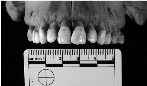
Fig. 1. Slight concavities are evident on the central portion of the incisal edge of the upper right central incisor, and the distal portion of the incisal edge of the left central incisor

Individual 2266 is a 44-year-old African American male. Cause of death was aortic insufficiency. All teeth are present except the left second premolar and the right first permanent molar. The upper central incisors demonstrate uneven incisal edges (Fig. 1). Slight concavities are evident on the central portion of the incisal edge of the upper right central incisor, and the distal portion of the incisal edge of the left central incisor. The crown surfaces of central incisors have shallow vertical grooves in the enamel, both located on the distal portion. The upper lateral incisors are peg like in shape and display isolated pits. No hypoplasia is observed in the mandibular teeth. No bone pathologies were observed.