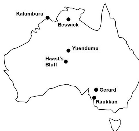
Fig. 1. Location of Aboriginal Australian communities of this study

Three samples were included from the post-1990 period; children and adolescents from Kalumburu in a cross-sectional survey conducted in 1993; and children from Gerard and Raukkan, respectively. The mixed longitudinal sample of the latter (1996–2002) was converted into a single cross-sectional sample by selecting individuals at the age of oldest measurement. Ages were known exactly for all three samples. Kalumburu, in the northwest of Western Australia, became a permanent settlement in 1908 with the establishment of a mission. Formal separation of the mission and community occurred in 1980; the store, medical clinic and school there are now independent of the mission. The population totalled approximately 350 in the early 1990s. Gerard and Raukkan are two self-governing Aboriginal communities in the lower Murray region of South Australia of approximately 120 individuals each. They differ significantly in both their history and current socio-economic circumstances. Gerard, established in 1945 to receive Aboriginal people being moved from other locations, is the most disadvantaged in terms of community resources and socio-economic circumstances. There is no school there, and there is