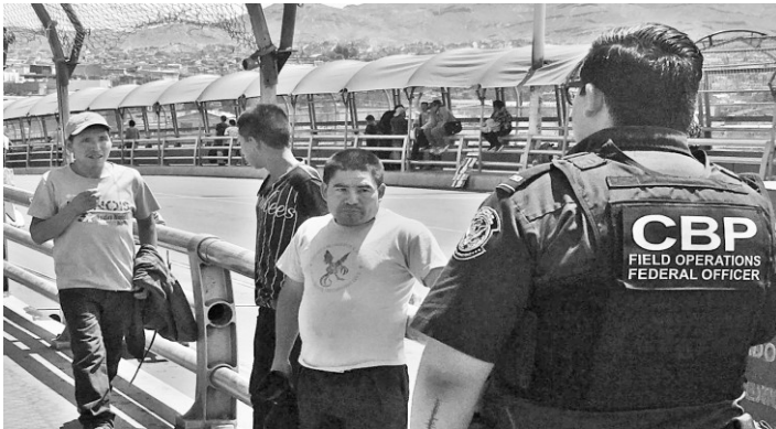
Picture 1. Step 1: CBP officers turning back Guatemalan migrants seeking asylum at the Paso del Norte Bridge in El Paso, Texas before crossing into USA territory (middle of the Rio Grande) – June 2, 2018