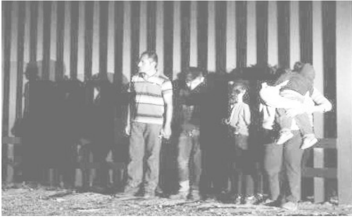
Picture 2. Step 2: Migrants unable to cross the bridge to seek asylum, move off the bridge into other areas along the Rio Grande and are apprehended by Border Patrol agents using surveillance technology.

Note. Adapted from “Immigrants who illegally crossed the Mexico-U.S. border are apprehended by the U.S. border patrol in the Rio Grande Valley sector, near McAllen, Texas,” by L. Elliott, 2018, April 5, Reuters .