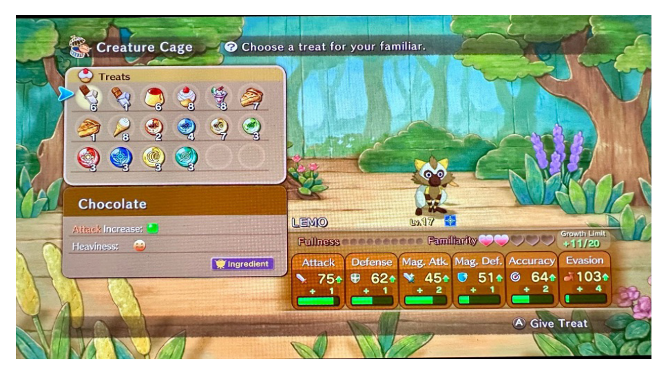
Figure 2. To permanently strengthen familiars in Ni no Kuni , players feed them a variety of detailed treats.