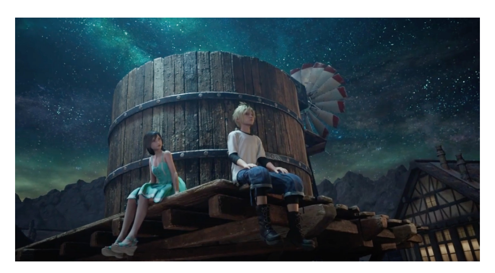
Figure 3. Tifa and Cloud sitting at the water tower, contemplating their future. FF VII-R.

In an intimate conversation the two characters ponder their future and their relationship. Cloud tells Tifa that he has decided to leave town to become a soldier. Tifa wants him to promise that he will save her if she is "ever trapped or in trouble [...]" (FF VII-R). Cloud agrees and the analepsis jumps to a more recent sequence in Tifa's bar. Tifa tells Cloud that she "feels trapped" (FF VII-R). Back in the present, Cloud realizes that he must fulfill his promise and help Tifa. The sequence thus demarcates a crucial point of character development for Cloud.