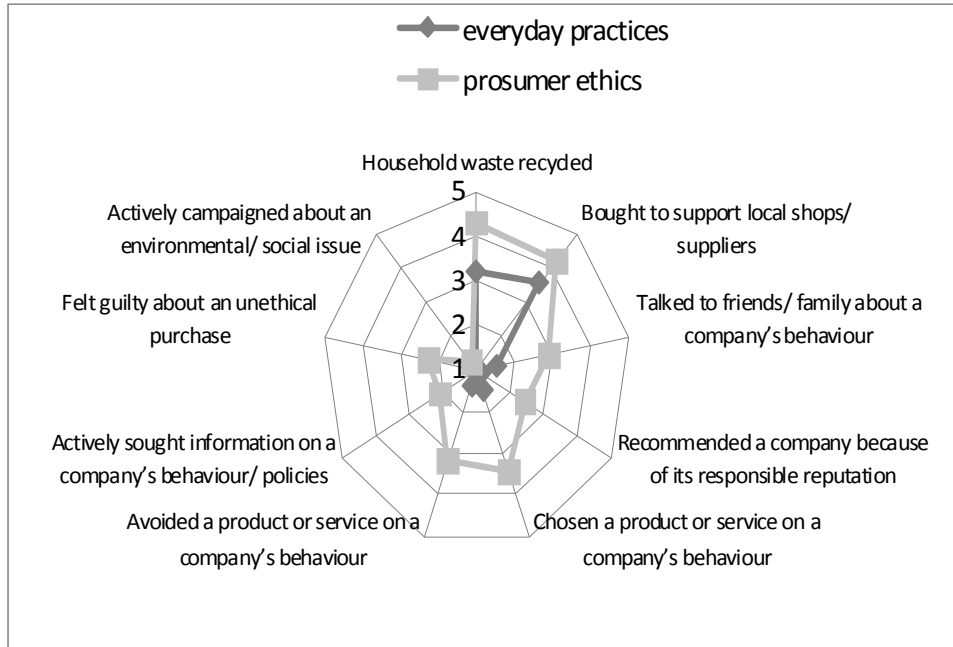
Chart 3. Consumer behaviour (average values on a scale from 1 to 5)