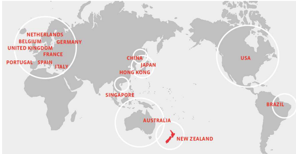
Graph 1. LOHAS markets identified globally