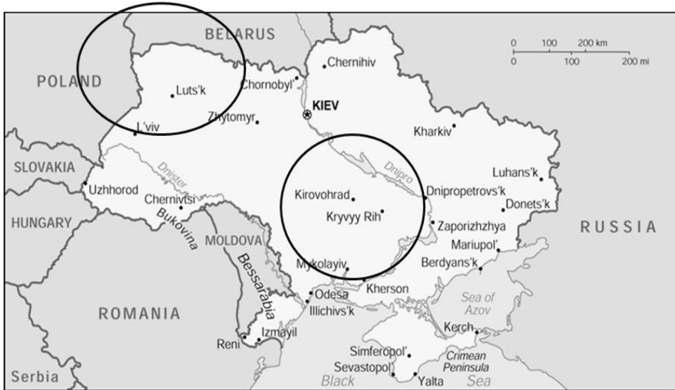
Figure 1. Study area

Western Ukraine Oblasts: Luts'k (16 rayons), Rivne (16 rayons), Chernivtsi (11 rayons), Lviv (19 rayons)