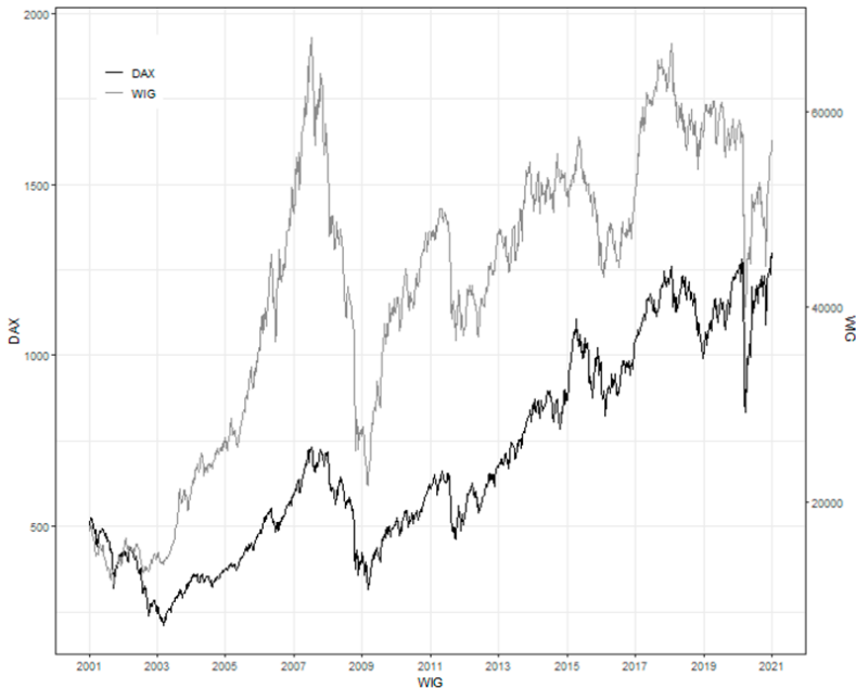
Figure 1. Time series of WIG and DAX index, 2001–2020

Based on these prices, the logarithmic weekly rates of return were calculated as R_{it} = \ln P_{it} - \ln P_{it-1} , where R_{it} is the logarithmic rate of return on the i -th index at time t , and P_{it} is the price of the i -th index at time t . The rates of return on industry indices were calculated without dividends. For each industry, we received 1043 observations of return in the period 2001–2020 (20 years). Data were obtained from the Refinitiv EIKON database, and all tables are labeled with the RIC (Reuters Instrument Code). They formed the basis for the present research. Figure 1 presents the time series of the WIG and DAX index.