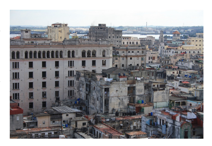
Photo 2. The panorama of the city from Edificio Bacardi Source S. Kaczmarek (February 2015)

The central part of the city looks depressing (Photo 2).