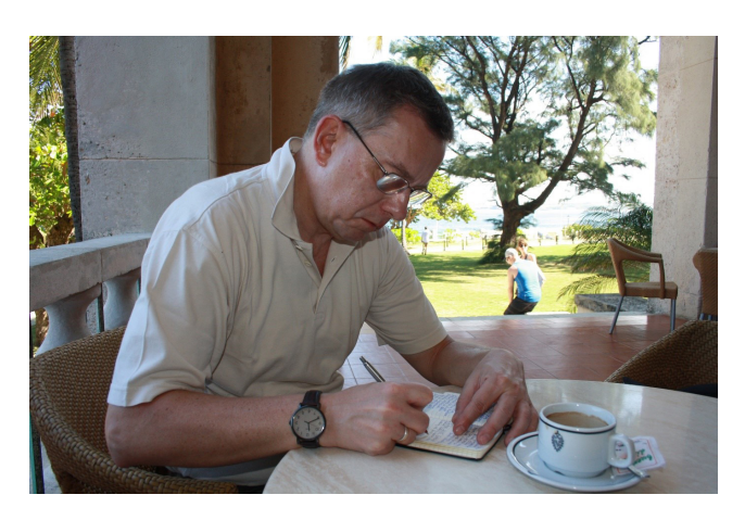
Photo 1. Hotel Nacional de Cuba – field study Source: S. Kaczmarek (February 2015)

whose main arena is Havana. This city is presented in two historical contexts, the first being the 1950s through works by G. Cabrera Infante: Delito Por Bailar el Chachacha and Tres Triste Tigres (Cabrera Infante, 2009, 2016). The second is the 1990s and the poignant picture of Havana presented by P.J. Gutiérrez in Trilogia sucia de la Habana ( Dirty Havana Trilogy ) (Gutiérrez, 2019). The field study was conducted in the 2010s and took advantage of the aleatoric approach to a reader/tourist experiencing literature space in Havana. The basic research method was the auto-ethnographic approach (Botterill, Platenkamp, 2012) where field research requires direct involvement on the part of the researcher in the interpretation of the literary work at the place of its 'action' (Photo 1).