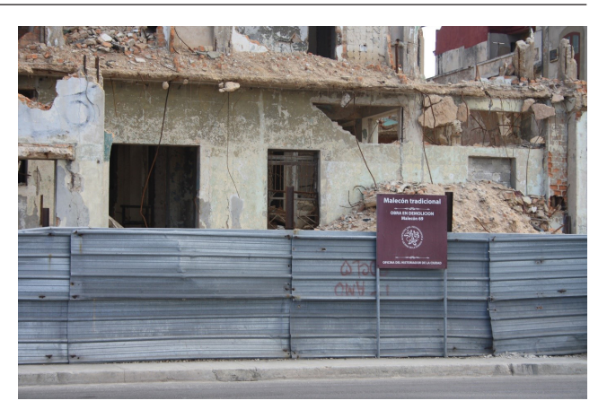
Photo 7. Malecón – the ruins of the boulevard

The hotel was exquisite. It cost a lot but it was worth the price. If the Cubans have learnt something from us, it is the sense of comfort, and the Nacional is a luxury hotel. What's more, their service is irreproachable. We woke up after dark and went for a walk nearby (Cabrera Infante, 2016, p. 191).