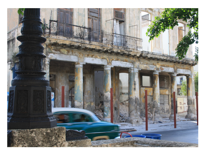
Photo 8. Dilapidated Old Havana