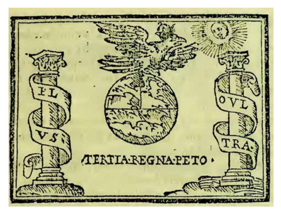
Illustration 10. The emblem of 34 "Non plus ultra. Tertia regna peto" (Covarrubias de Orozco 1610).