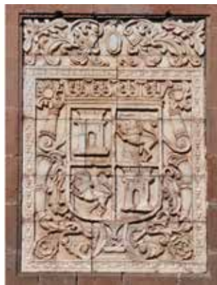
Illustration 4. The royal coat of arms, the emblem of XXX "Agro Dulce", (Horrozco y Covarrubias 1604: 160); The coat of arms of Castile and Leon, functioning as a simplified coat of arms of the King of Spain, the façade of the El Triunfo church, Cusco, Peru.