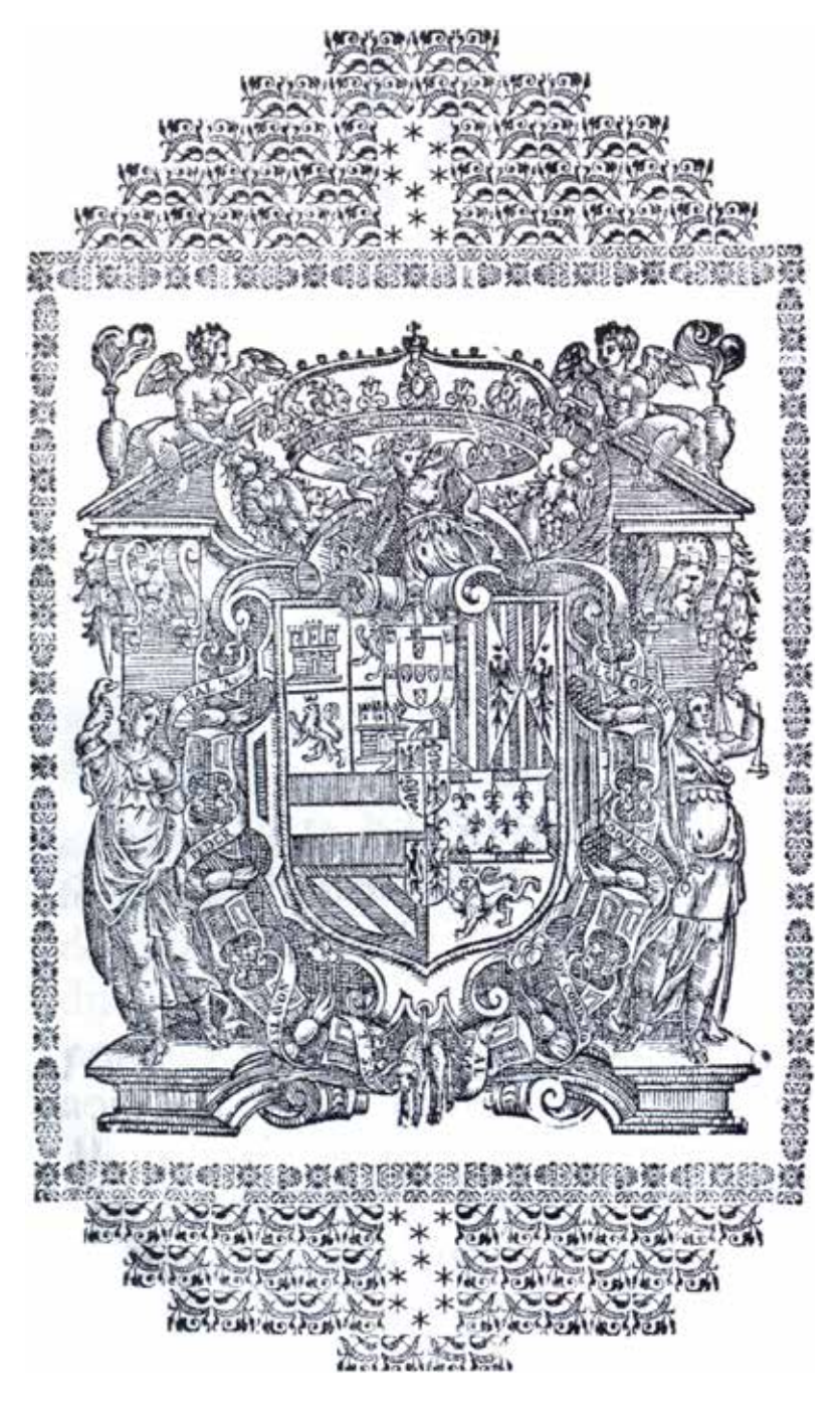
Illustration 5. The royal Coat of Arms, Book of funerary ceremony of Louis I in the Cathedral of Mexico, (Villerias Roelas 1725).