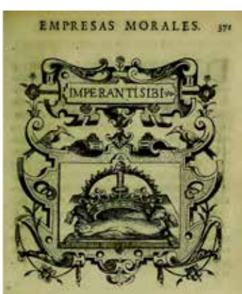
Illustration 6. The emblem "Fallax Bonum" (Saavedra Fajardo, 1640–1642: 127); The emblem "Imperantisibi" (Borja 1680: 371)