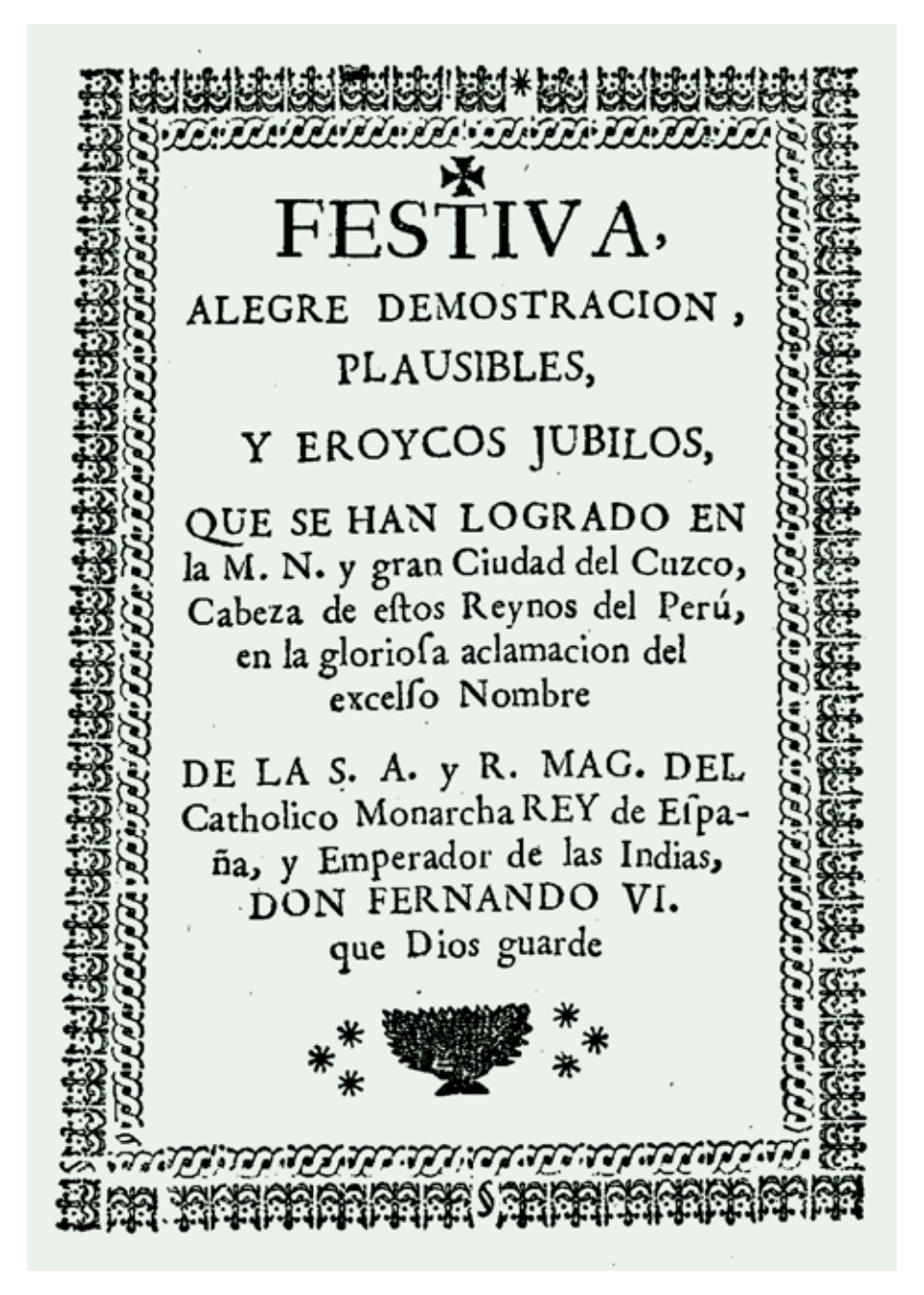
Illustration 1. The title page of the book published in Lima on the occasion of the proclamation of Ferdinand VI in Cusco; (Santander 1748).