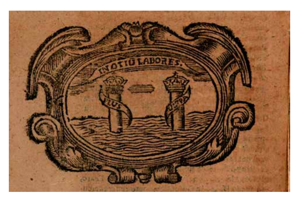
Illustration 9. The emblem "Non plus ultra" (Lorea 1647: 8).