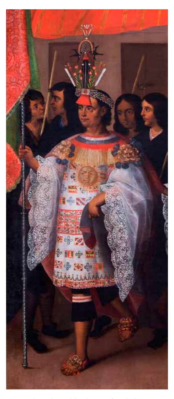
Illustration 3. Indian cacique dressed in traditional Inca outfit with elements of Spanish clothing, a fragment of the painting showing the procession of San Sebastián parish in Cusco; about 1675–1680, oil on canvas, Museo de Arte Religioso, Cusco, Peru.